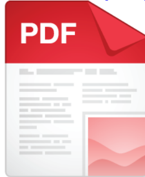
Padre Pio Pilgrimage CPP flyer PP.pdf