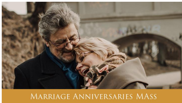
MARRIAGE ANNIVERSARIES MASS