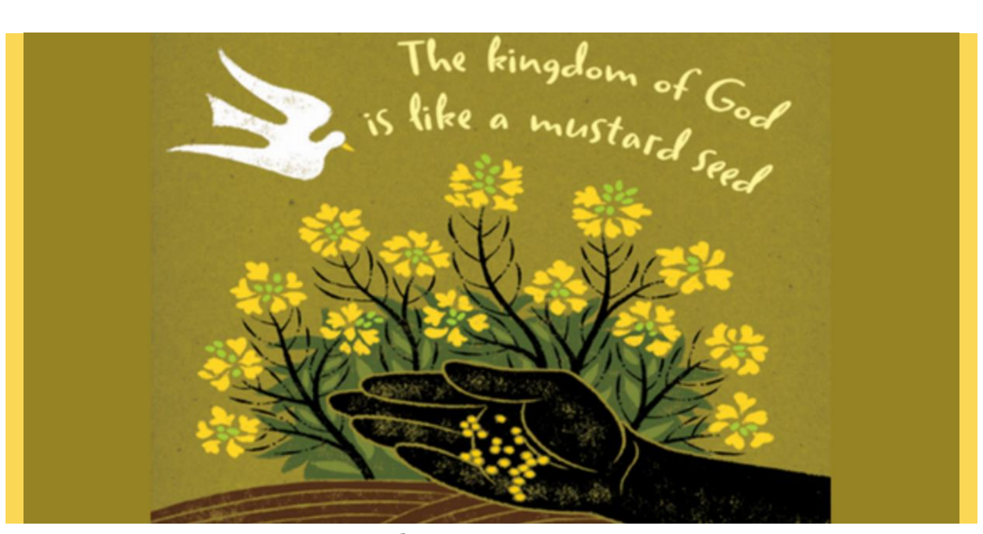
Sunday \ 13^{\rm th} \ June \ 2021 Eleventh Sunday in Ordinary Time - Year B