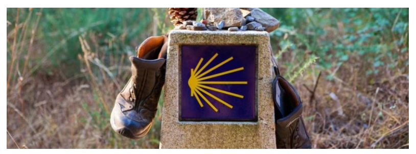
Pilgrimage Information Meeting Sunday 20th June 7:00 pm

Priests' House, Portmore Way, Weybridge, Surrey, KT13 8JD email weybridge@abdiocese.org.uk website http://www.cpp.org.uk/ twitter @CPPweybridge